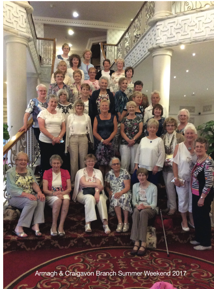
Armagh & Craigavon Branch Summer Weekend 2017

In 2012 it was decided to withdraw from the UK NHS Retirement Fellowship and set up our own organisation in Northern Ireland called 'The Health and Social Care Retirement Fellowship (NI)'. We still, of course maintain close links with the Fellowship in Great Britain.